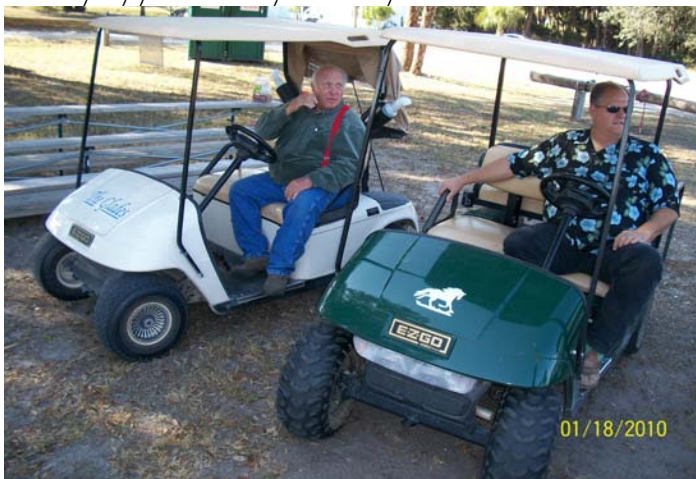
The Glades Resort

No manufactured objects should enter the sewer system except toilet paper. Paper towels, feminine products, dish towels, hand towels, wash cloths, etc., should be discarded in the trash. We would really appreciate your help with this matter.